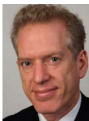
Jeffrey Zaslow MOTIVATION New York Times best-selling author "The Last Lecture"

With the exception of his brilliant trading successes in the stock market, you'll be hard pressed to find anything "Wall Street" about investment pro Phil Town. After saving the lives of a group of trustees from Outward Bound on the Colorado River rapids, one grateful client returned the favour by offering to guide Phil to investment success in the stock market. Phil then learned Warren Buffett's cardinal rule of trading - don't lose money. With an initial investment of 1000 dollars, Phil employed his mentor's lessons and built a multi-million dollar stock portfolio. Coupled with his New York Times best seller, "Rule #1", Phil Town has become America's freshest and most exciting authority on self-directed investing.