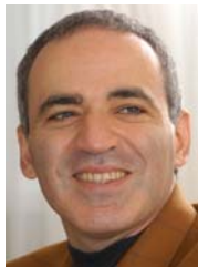
Garry Kasparov LEADERSHIP Innovation and Success

Patrick Lencioni is founder and president of The Table Group Inc., a management consulting firm focused on executive team-development and organizational health. He has authored five business books, including The Five Dysfunctions of a Team, which continues gracing the best-seller lists of The New York Times and Wall Street Journal. His other books include, Overcoming the Five Dysfunctions of a Team: A Field Guide, Death by Meeting and The Four Obsessions of an Extraordinary Executive. In addition to this, Lencioni also consults with executives and world class organizations such as New York Life, Microsoft, Southwest Airlines, Charles Schwab and FedEx, to name a few.