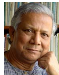
Dr. Muhammad Yunus CORPORATE SOCIAL RESPONSIBILITY Winner of The Nobel Peace Prize

In a listing of top chess champions formed in 1988, Casablanca, Karpov and Fischer were named; however above all sat twenty-five year old Russian, Garry Kasparov. A World Champion until his retirement in 2005, Garry went on to open The Kasparov Chess Academy near the campus of Tel Aviv University. Also since retirement, he has devoted his time to politics and writing. In 2007, he entered the Russian Presidential race receiving 379 of 498 votes at a congress held in Moscow. In addition Kasparov has authored several books on chess and is a regular contributor to the Wall Street Journal, TIME Magazine and Forbes.