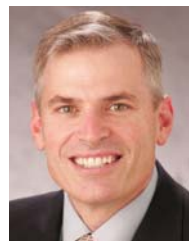
Patrick Lencioni MANAGEMENT Author of the best-seller "The Five Dysfunctions of a Team"

ALL LIVE AND IN PERSON. INTERNATIONAL BEST SELLING AUTHORS, IN ONE DAY THAT WILL GIVE YOU THE COMPETITIVE ADVANTAGE IN YOUR PERSONAL AND PROFESSIONAL LIFE